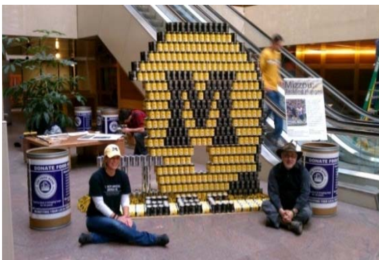
Canstruction The community service Canstruction project for the Food Bank used canned food to construct a Mizzou football helmet