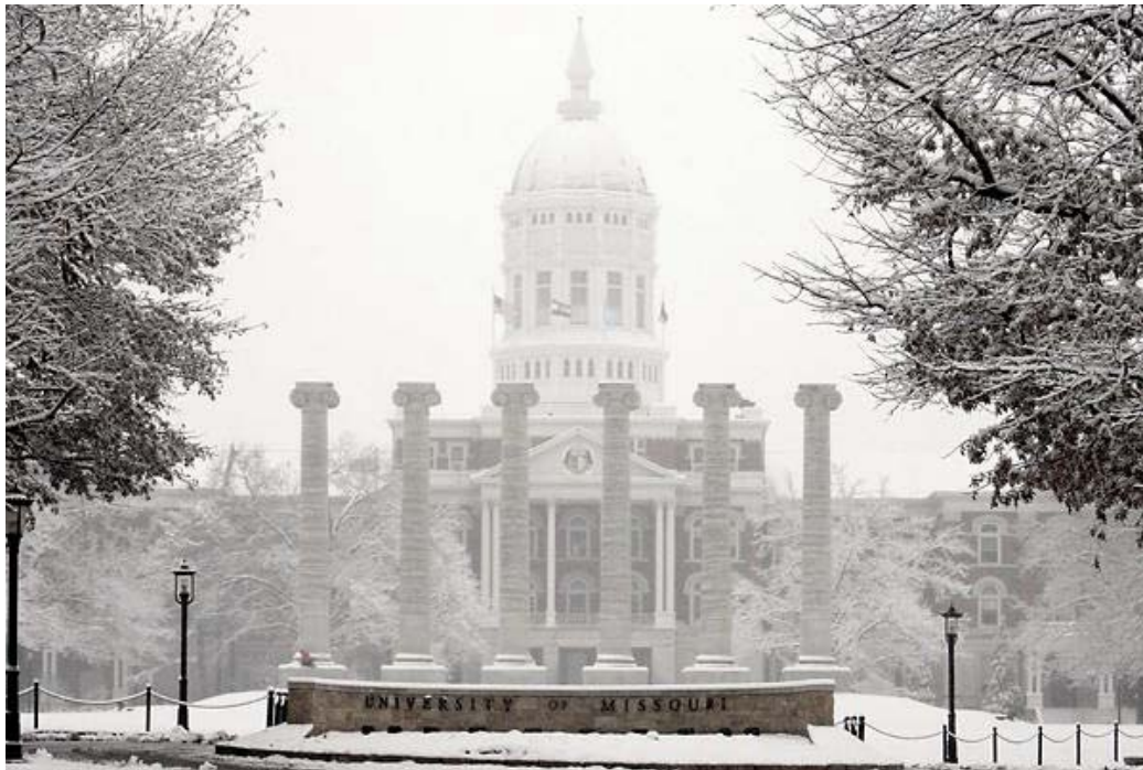
UNIVERSITY OF MISSOURI – ARCHITECTURAL STUDIES